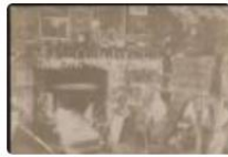
Photograph - 1900 Blackboard and fireplace in the schoolroom at pringfield Public School, Goulburn, New South Wales, approximately 1900