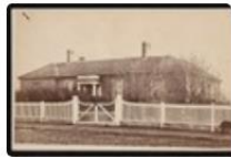
Photograph, Artefact - 1849 Goulburn Hospital founded in 1849